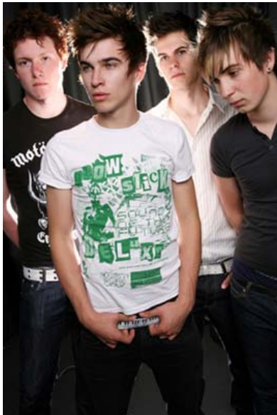
South West Recordings Band, Pinstripe